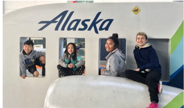
At the Museum of Flight.