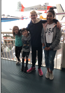
At museum of Flight