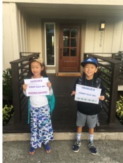
On to School